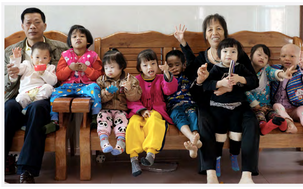
*Names of children and family members in all stories have been changed to protect their privacy.