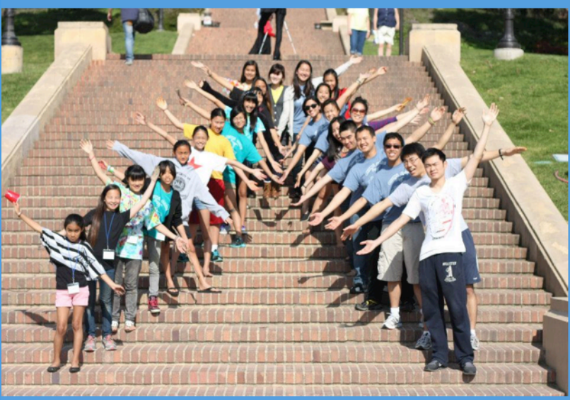
Students at UCLA

Sign up to run a 5K, half or full marathon. The more people on your team, the better!