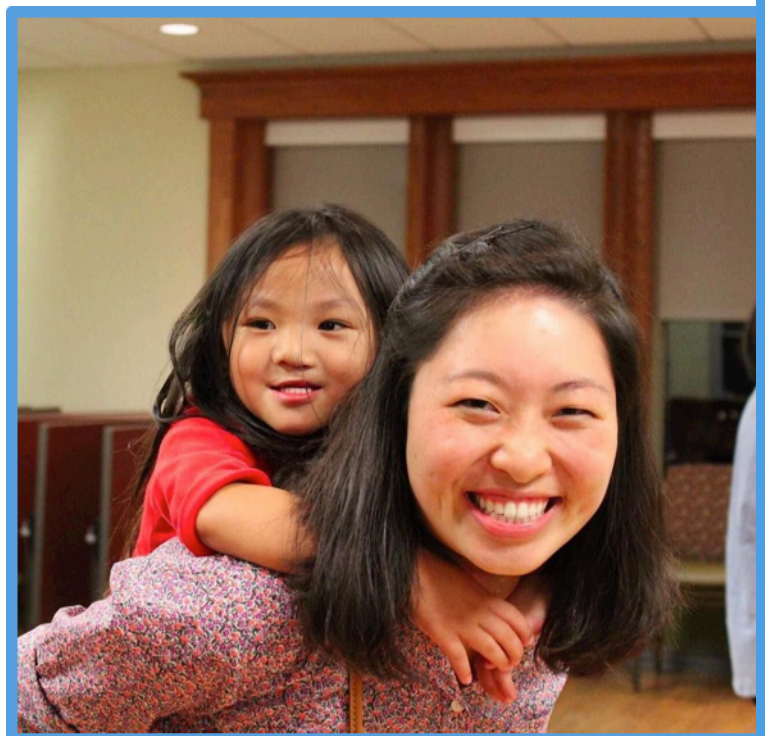
Student at Washington University in St. Louis

Give them clear expectations and let them know how much they mean to you.