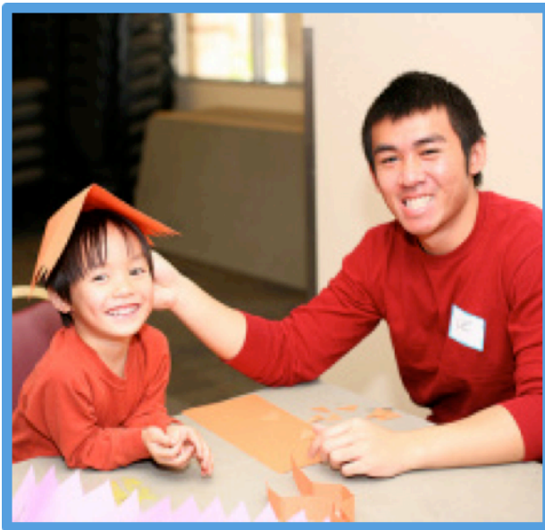
Student at UT Austin

Volunteering with kids through organizations in your local community as a mentor or tutor for a meaningful cause can be an incredibly rewarding experience. It also gives you an opportunity to build ties with your club members and attract new members interested in giving back locally.